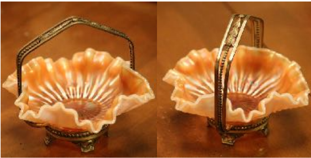
The Jeweled Heart bowl in a metal frame is shown above in two photos taken by Diane Highnam. The second one shows the beautiful metal work of the frame.