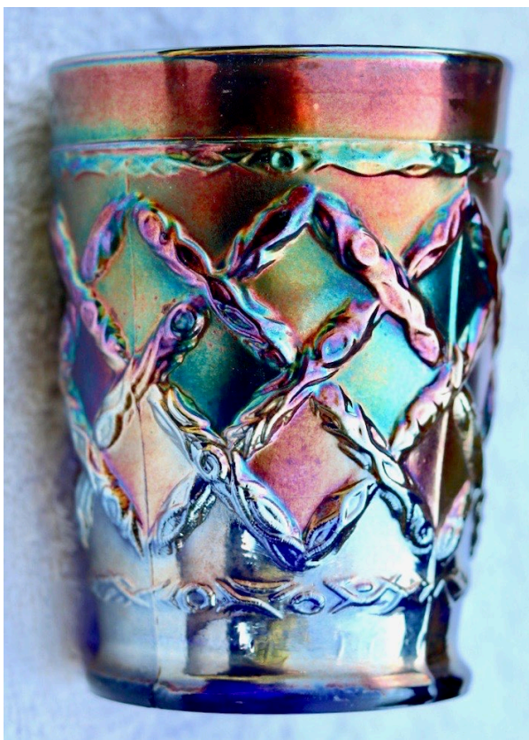
The variant tumbler lacks the grass.

Unlike pitchers, all of which are alike in design, tumblers come in two versions. The standard version has three pattern elements. The primary element is the lattice. The second is a narrow cord that demarcates the latticework from "switch grass" which fills the area between it and the base. An area at the top is un-patterned. The amethyst are occasionally found with souvenir lettering wrapped around this plain band. Most, maybe all, the marigold, amethyst, and white tumblers are the standard version. The illustrated slice of Neal Becker's amethyst tumbler shows the lattice work, the cord, and the grass at the bottom.