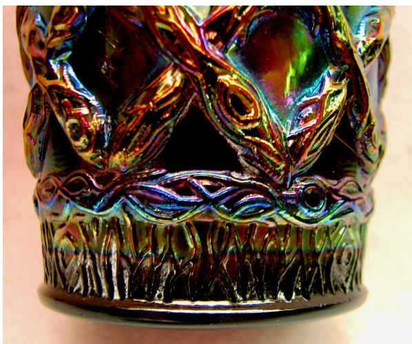
The standard tumbler has the grass around the bottom.

harder to track down but available. The cobalt rarely surface. The quality of surface colors of the marigold, amethyst, and white vary widely. Iridescence on some is beautiful, on others borderline or worse. The surface color of the cobalt is often largely or partially a gun metal silver or a dull gold.