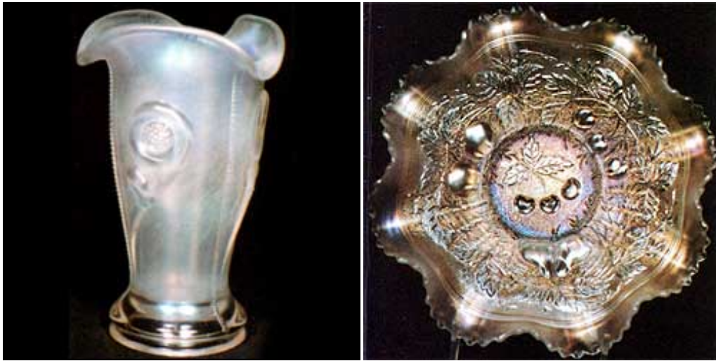
Left: Tornado Vase (Photo #13) Right: Three Fruits Collar Base 9" Stippled Bowl (Photo #14)

PHOTO NO. 13--TORNADO VASE (Northwood)--$950. Only this one has turned up in white. Three are known in ice blue, but none are confirmed in aqua opal or ice green. The standard colors (marigold, green, and purple) were made in two sizes. This white one and the three in ice blue are the small size. The white one is on a plain surface, but the ice blue ones are ribbed. A few of these vases are known in cobalt blue and there is one whimsy shape in sapphire blue.