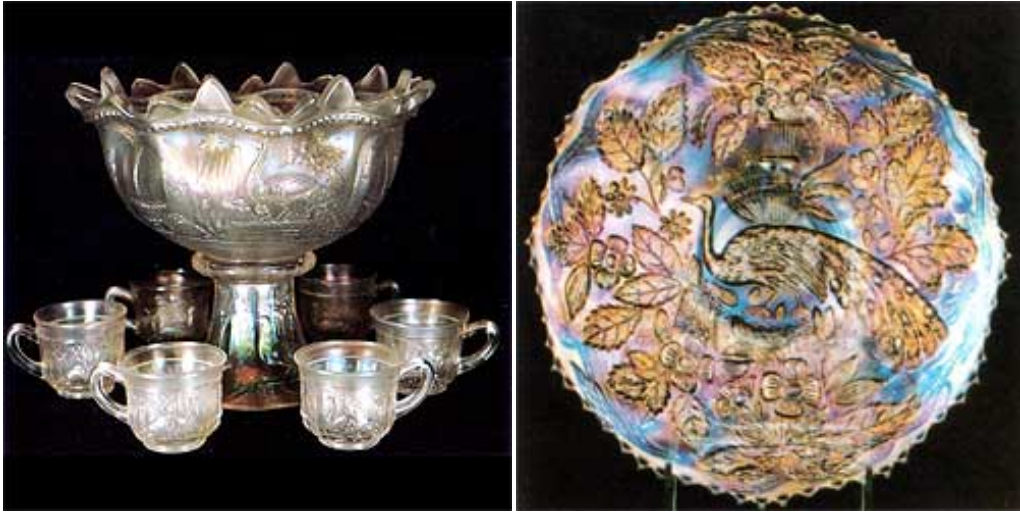
Left: Peacock at the Fountain Punch Set (Photo #1) Right: Fenton's Peacock & Urn 9" Plate (Photo #2)

PHOTO NO. 1--PEACOCK AT THE FOUNTAIN PUNCH SET (Northwood)--$2,500. Not as rare as the other pastels in this pattern--aqua opal, ice green, or ice blue--but still a tough one to find. One sold for $2,250 at the Heart of America convention auction in 1984.