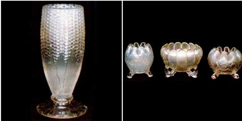
Left: Corn Vase (Photo #9)