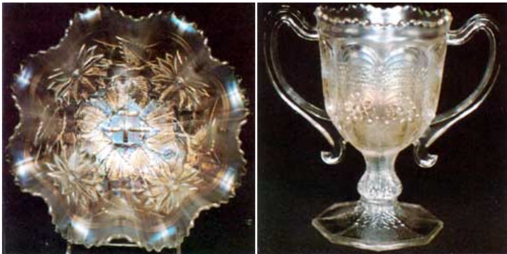
Left: Poinsettia Footed 8 1/2" Ruffled Bowl (Photo #11)

PHOTO NO. 10--ROSE BOWLS (Northwood)--The Finecut and Roses ($350) is the most available of the three white Northwood rose bowls shown here. The Leaf and Beads ($650) and the Beaded Cable ($600) are seldom offered for sale. They go into rose bowl collections and are hard to shake loose. All pastel rosebowls are tough to come by and most of them are down right rare. No doubt, the Grape Delight and Persian Medallion in white are the most available.