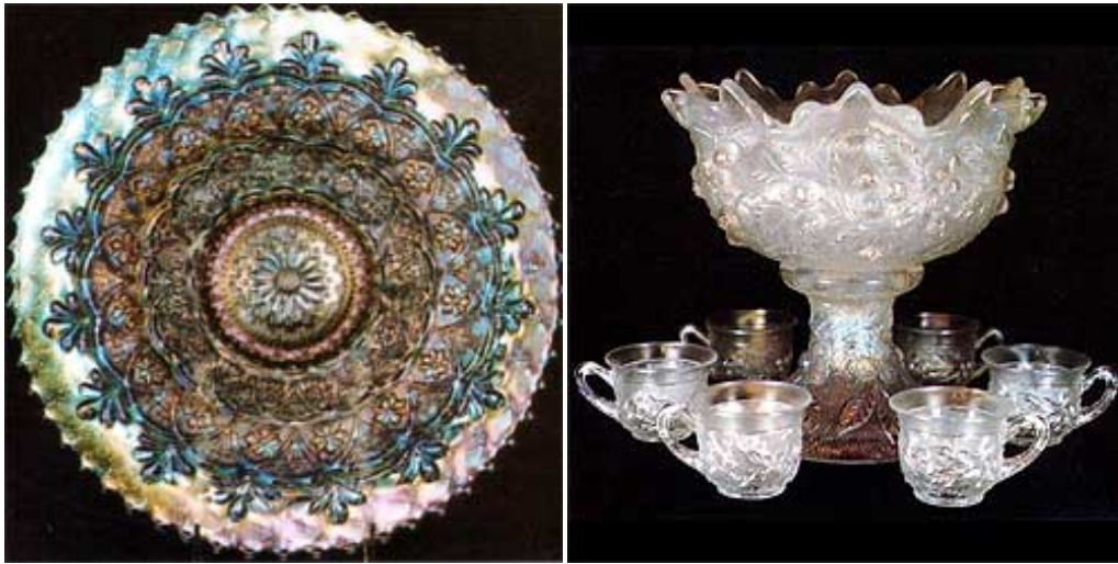
Left: Persian Garden 12 1/2" Sandwich Tray (Photo #5) Right: Acorn Burrs Punch Set (Photo #6)

PHOTO NO. 5--PERSIAN GARDEN SANDWICH TRAY (Dugan)--$2,000. Rare and beautiful in any of the three colors in which it has been found--white, amethyst, and peach opal. One of the three known in peach opal sold at the Courtney auction in 1985 for $4,750.