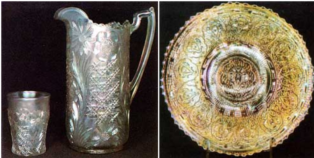
Left: Cosmos & Cane Water Pitcher & Tumbler (Photo #7) Right: Persian Medallion 9" Plate (Photo #8)

PHOTO NO. 6--ACORN BURRS PUNCH SET (Northwood)--$2,750. Some of the popularity of the punch set in this pattern is the fact it was made in 8 different colors--white, purple, marigold, amethyst, green, ice blue, ice green, and one set in aqua opal. Blue cups have also turned up, but no bowl or base. The frosty white set in this pattern is outstanding. It will not sell for quite as much, but in my opinion, it is just as rare as the ice blue or ice green.