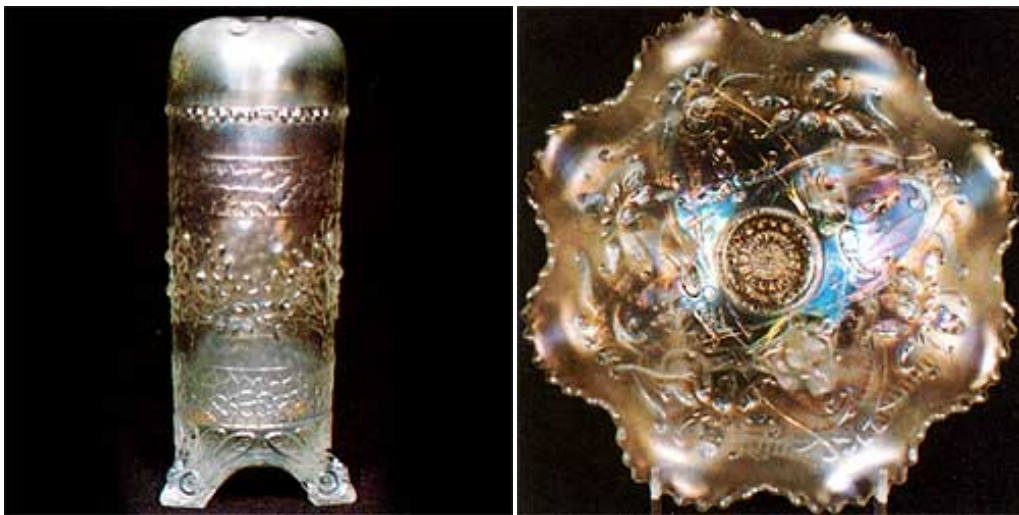
Left: Orange Tree Hat Pin Holder (Photo #15) Right: Wishbone Footed 8 1/2" Ruffled Bowl (Photo #16)

PHOTO NO. 14--THREE FRUITS 9" COLLAR BASE STIPPLED BOWL (Northwood)--$750. Only 3 or 4 of these are known in white and about the same number in ice green and ice blue. There are a few more in aqua opal. There is also a spatula footed version of this pattern in white, ice green, ice blue, and aqua opal. It carries the Meander pattern on the exterior. There is still a third version of this pattern in white that is on a dome base. It has Basketweave as an exterior pattern with Northwood's Vintage pattern superimposed on the Basketweave. In addition to white, I have seen this in ice green, marigold, green, and amethyst, but in no other pastel colors to my knowledge.