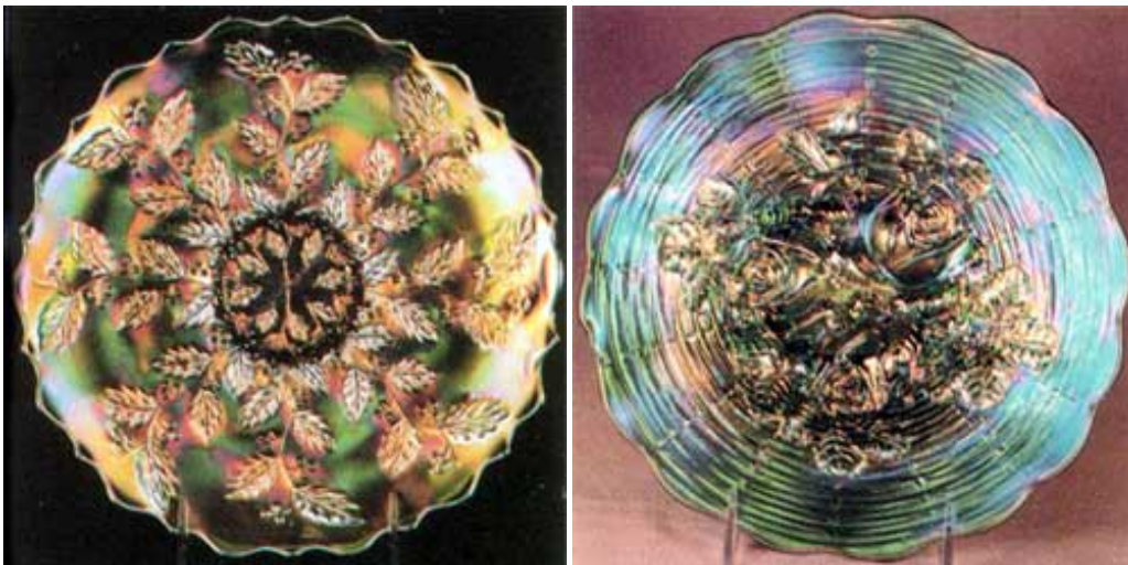
Left: Green Holly (Fenton) - $650 Right: Green Rose Show (Northwood) - $1,800

8. Absentee Dragon (Fenton)--Marigold $2,250). Two are known.