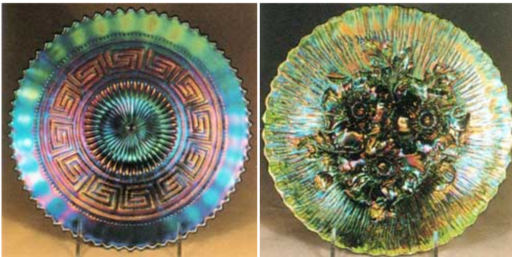
Left: Blue Greek Key (Northwood) - $1,800 Right: Green Poppy Show (Northwood) - $1,800

19. Dragon and Lotus (Fenton)--Blue ($950), Marigold $750). Two rare spatula footed plates are known in Peach Opal.