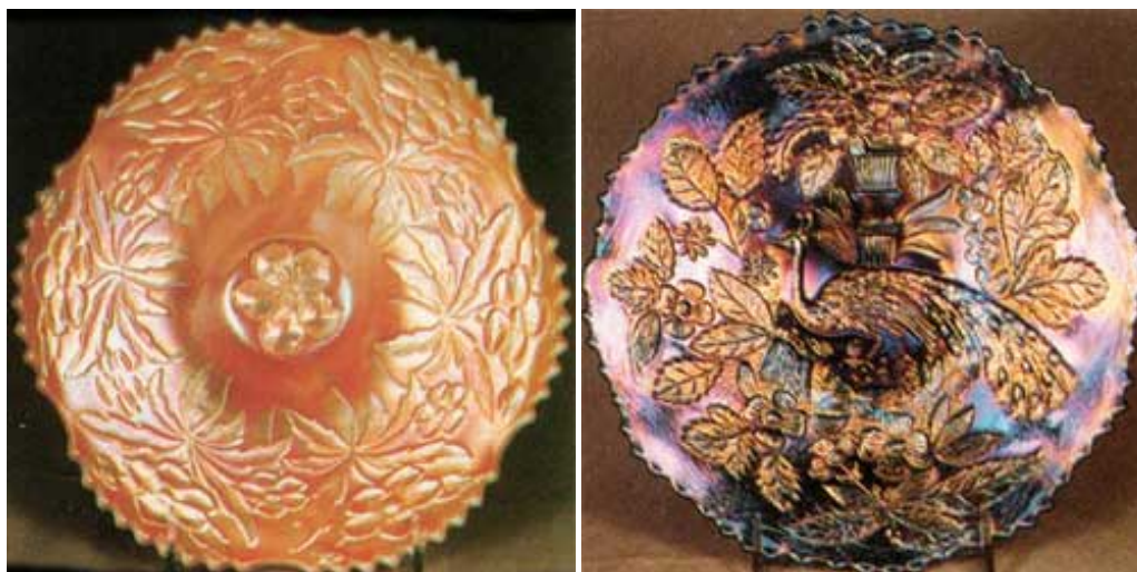
Left: Iridized Milk Glass Carolina Dogwood (Westmoreland) - $750 Right: Blue Peacock & Urn (Fenton) - $400

There are many plates that are much more rare than the ones shown here, but they could scarcely be more beautiful. I still have trouble getting a good picture of a pastel, so you will not see any in the color spread.