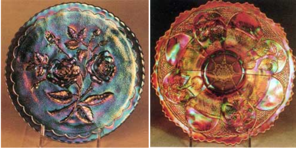
Left: Purple Open Rose (Imperial) - $450 Right: Absentee Dragon (Fenton) - $2,250

13. Greek Key (Northwood)--Blue $1,800).